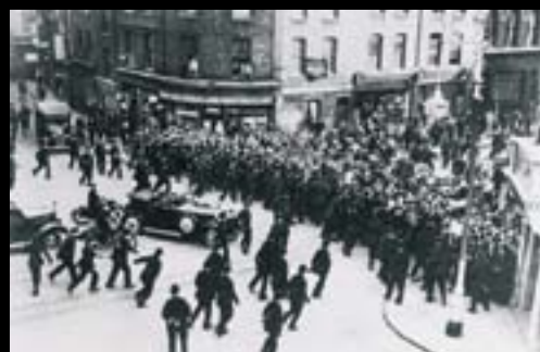
Fighting the Blackshirts ©THE JEWISH MUSEUM

They defended the East End then, as we must do now, as an anti-racist space for all its communities. In the East End people of different backgrounds, cultures and opinions share a common interest in combating those who promote racism, fascism, and bigotry of any kind.